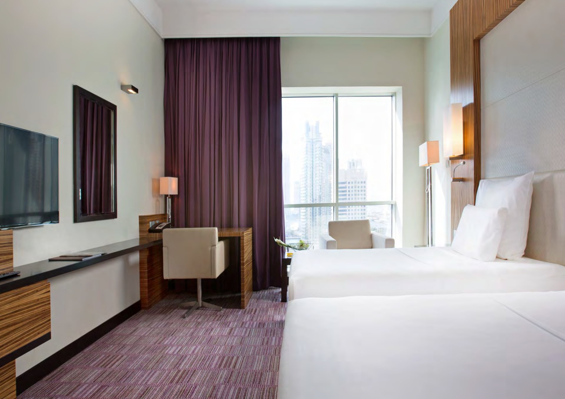
92 TWIN ROOMS