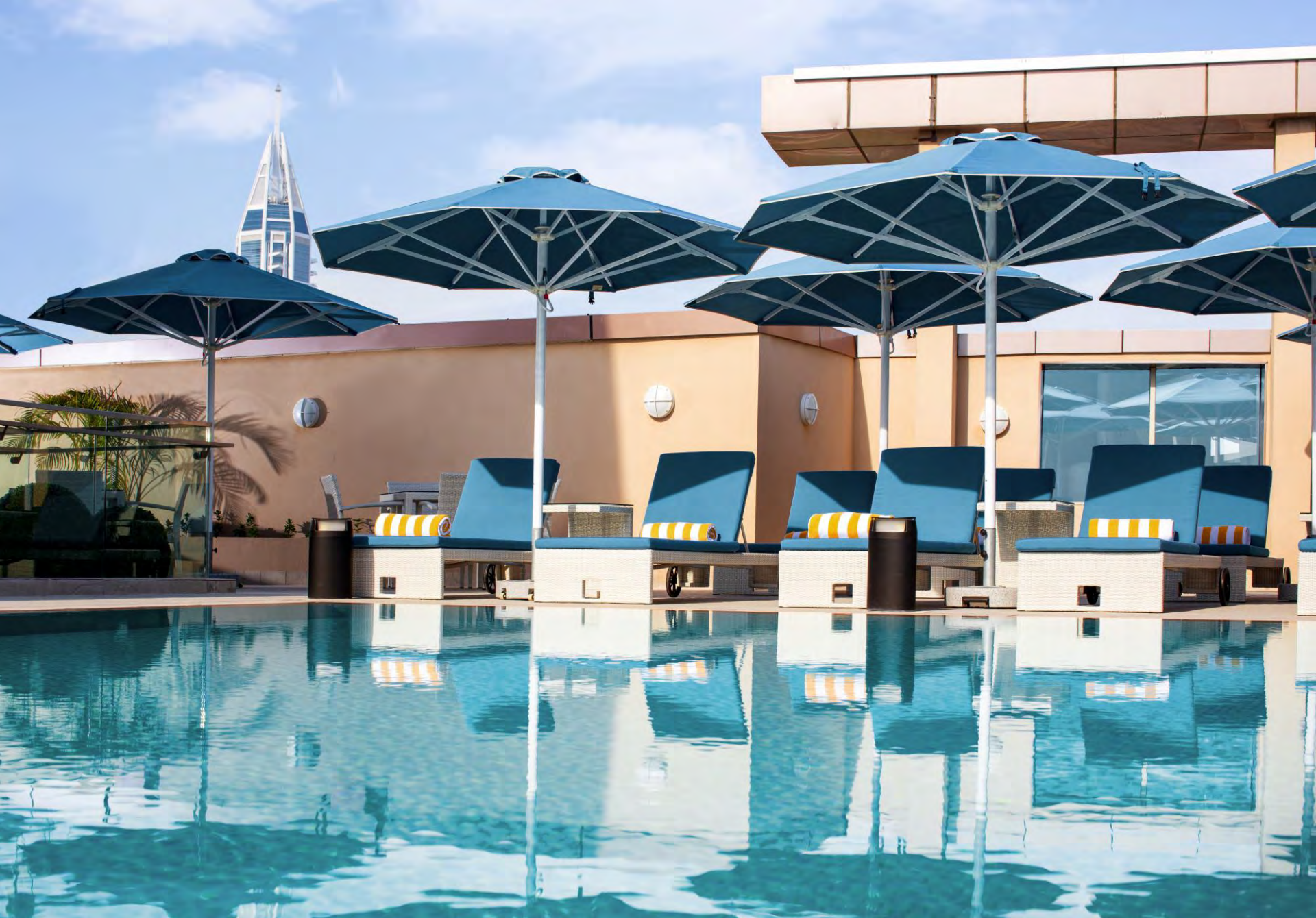
35 TH FLOOR ROOFTOP SWIMMING POOL AND JACUZZI