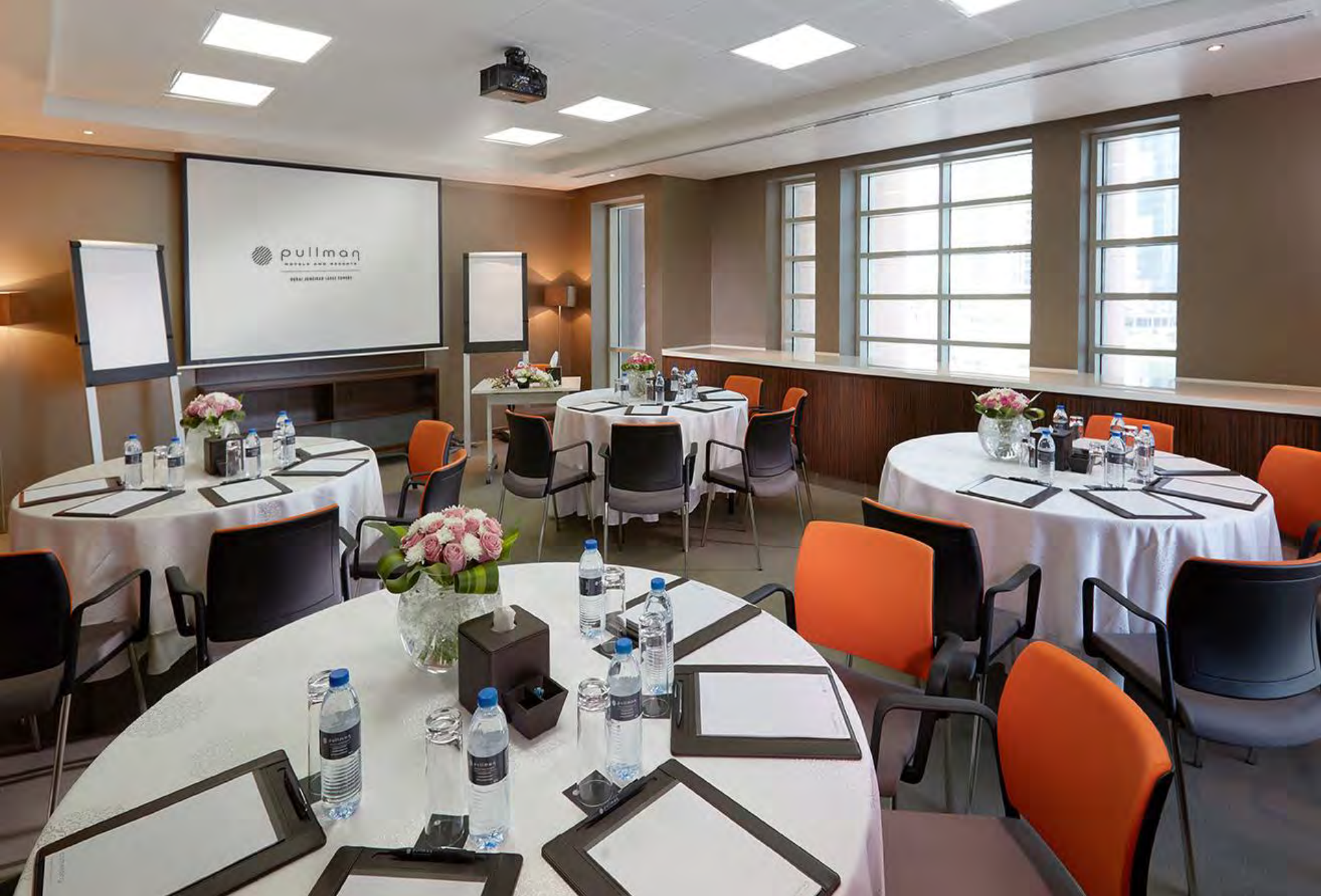
THE MEETING SPACE BOAST STATE-OF-THE-ART EQUIPMENT AND LATEST TECHNOLOGY WITH PERSONALIZED AND DEDICATED SERVICE