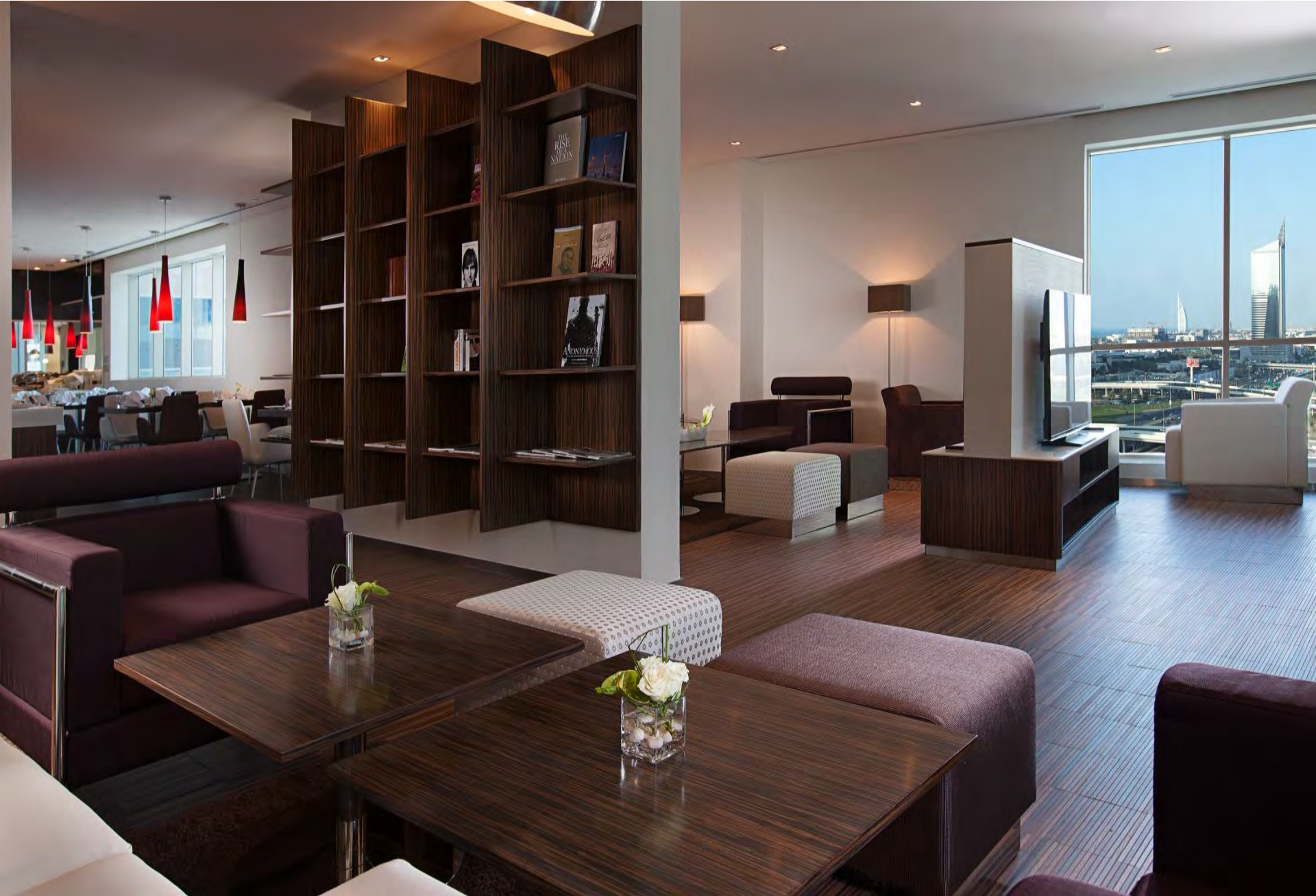
EXECUTIVE LOUNGE LOCATED ON THE 16 TH FLOOR OVERLOOKING DUBAI'S SKYLINE