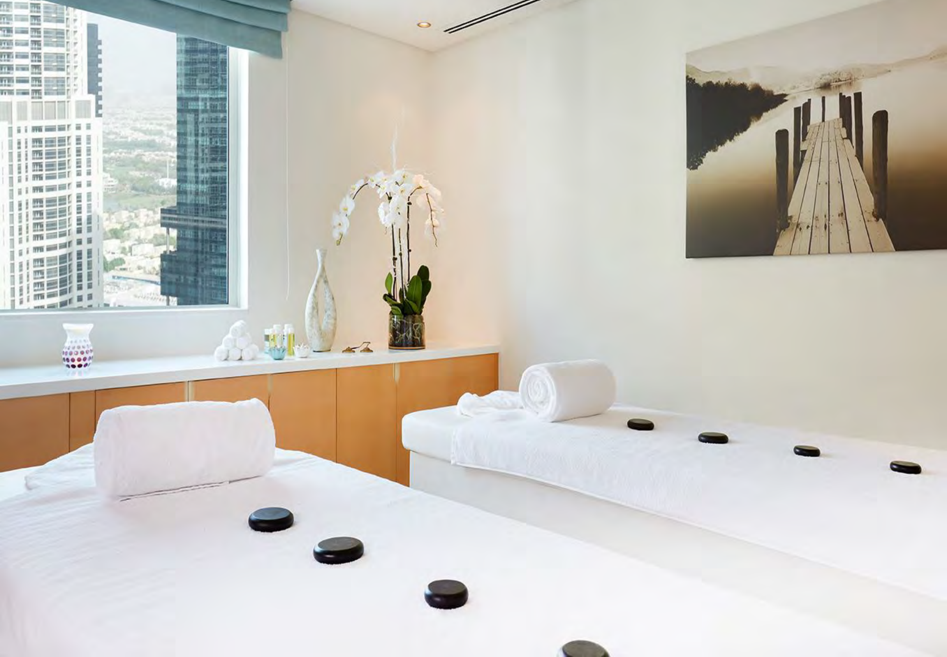
THE SERENITY FIT & SPA WITH 5 TREATMENT ROOMS, SAUNA AND STEAM FACILITIES