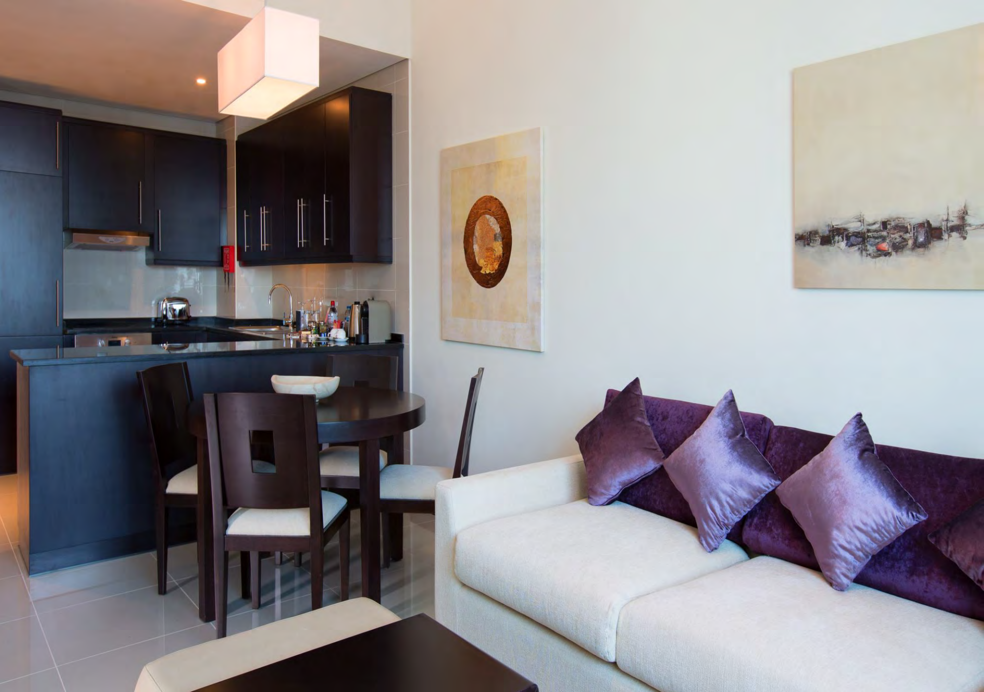
10 ONE BEDROOM SUITE WITH CLUB LOUNGE ACCESS