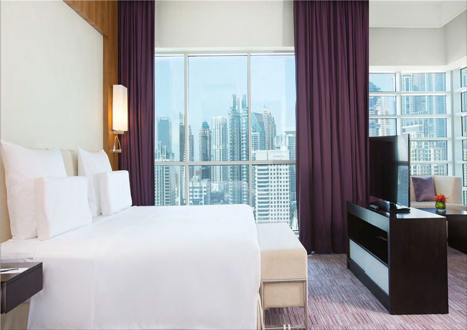
38 DELUXE ROOM- 40 SQM