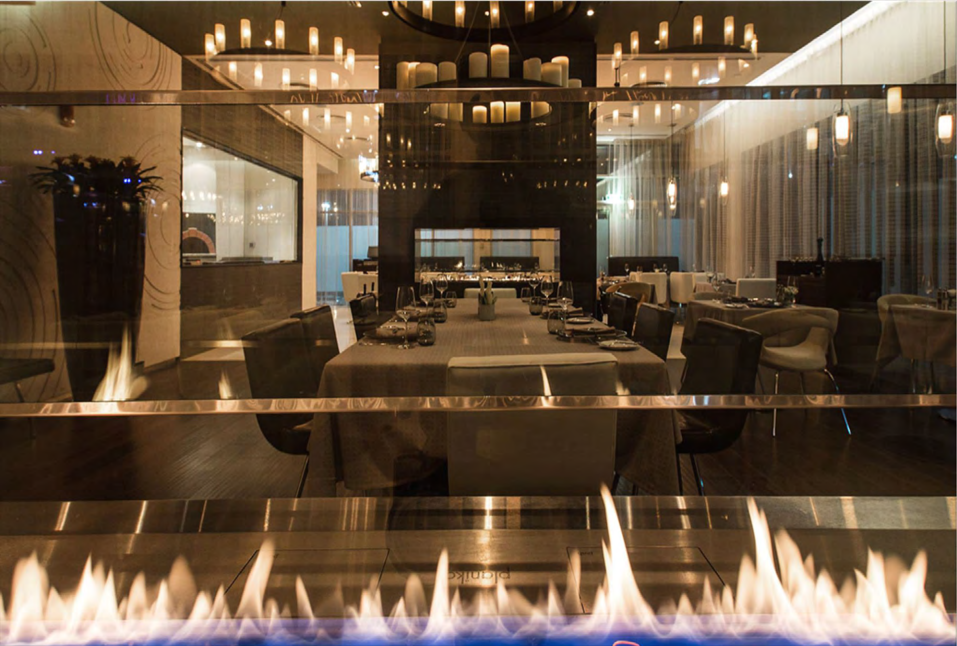
MANZONI – ITALIAN SPECIALTY RESTAURANT FEATURES A SHOW KITCHEN AND DECORATIVE FIRE PLACES HELMED BY AN ITALIAN CHEF